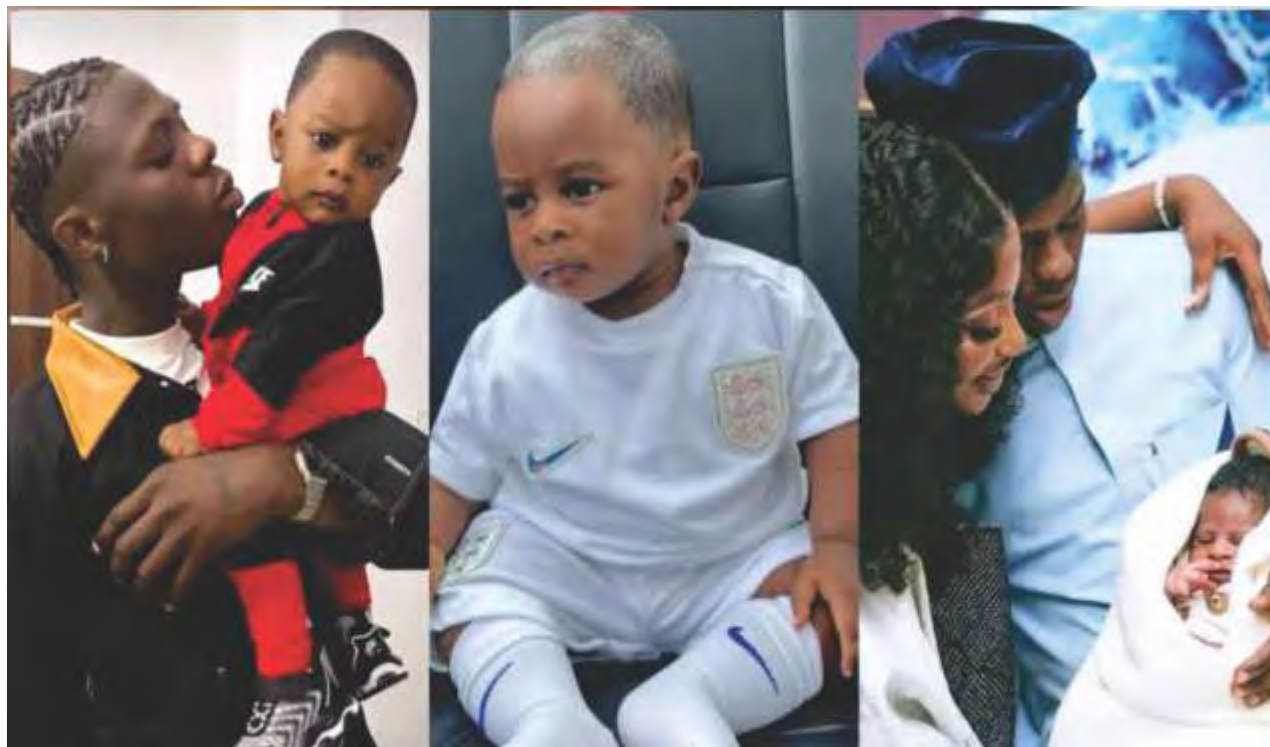
Mohbad, Wunmi and son